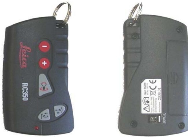
Product Dimensions : 20mm (L) x 50mm (W) x 85mm (H)