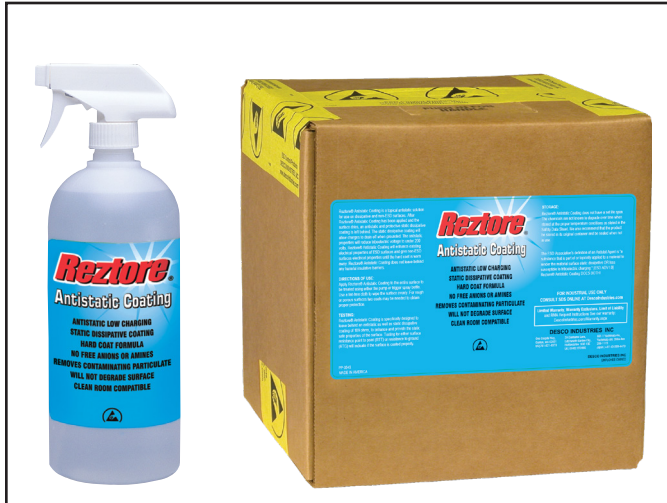
Figure 1. Reztore® Antistatic Coating 1 Quart (1 liter) Spray Bottle 2.5 Gallons (10 liters) Bag-in-Box