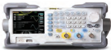
DG1000Z Series Arbitrary Waveform Generator

Models starting at just Compare vs Tek DS02000 and Agilent DSOX2000A