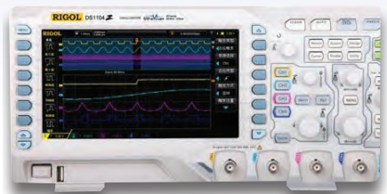
DS1000Z Series Digital Oscilloscopes

Models are available at 50MHz through 100MHz, with 1GS/Sec Sampling, up to 24MPts of memory and a Multi-Level Intensity Graded, 7" WVGA display. The DS1000Z Series of Digital Oscilloscopes is the perfect choice for educators needing an advanced analysis oscilloscope. Available options like 16 channel logic analysis, serial decode and an integrated 2 channel source make this a powerful analysis tool.