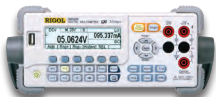
DM3000 Series Digital Multimeter

Models starting at just Compare vs Agilent E3633A