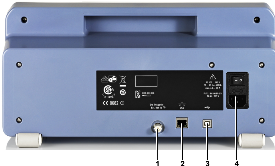
Figure 4-2: Rear panel of the R&S FPC