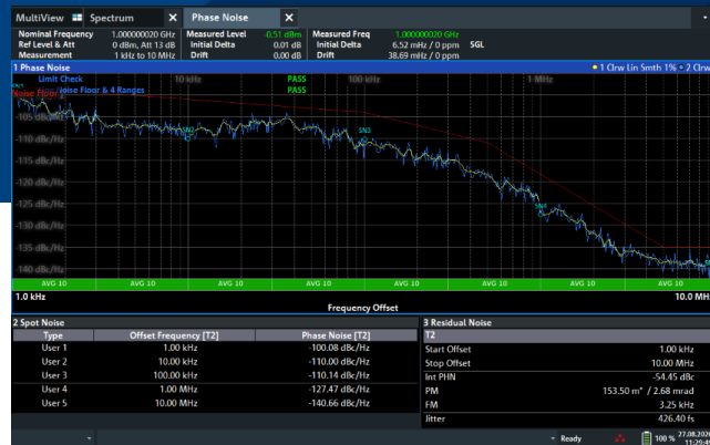
Phase noise measurement plus automatic limit checking, spot noise and residual noise indication.