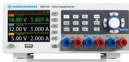
Front view of the R&S®NGE103B