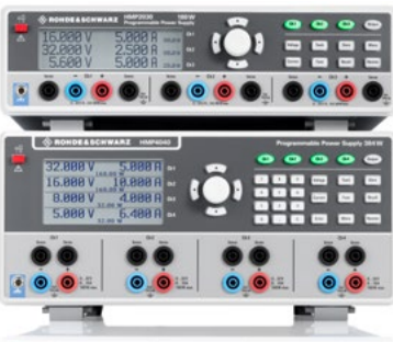
R&S®HMP2030 three-channel and R&S®HMP4040 four-channel power supply