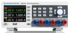
R&S®NGE103B three-channel power supply