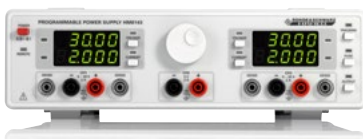
R&S®HM8143 three-channel arbitrary power supply