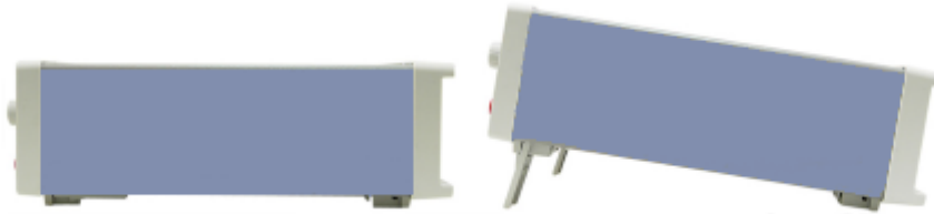
Figure 3-1: Operating positions