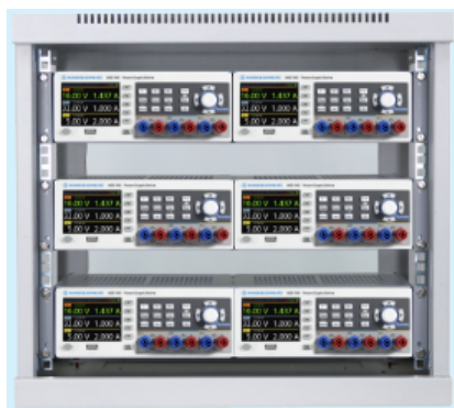
Figure 3-2: Rack mounting

Place the R&S NGE100B in an area where the ambient temperature is within +0 °C to +40 °C. The R&S NGE100B is fan-cooled and must be installed with sufficient space on the top to ensure a free flow of air. Required minimum distance: 1 rack unit (RU).