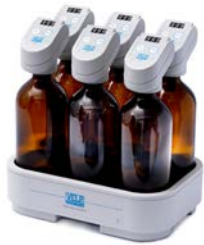
BOD Sensor System 6 - 10 positions - Results on display