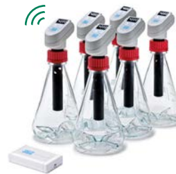
RESPIROMETRIC Sensor System for Soil Analysis Results on display and RESPIROSoft™