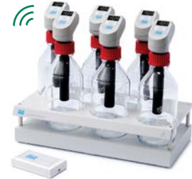
RESPIROMETRIC Sensor System MAXI - BMP 6 positions - Results on display and RESPIROSoft™