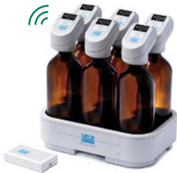
RESPIROMETRIC Sensor System - BOD 6 positions - Results on display and RESPIROSoft™