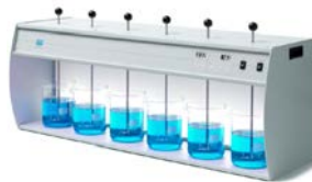
JLT 4 AND JLT 6