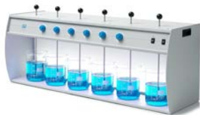
FC4S AND FC6S