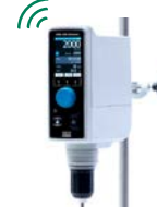
ermes enabled OHS 200 Advance Up to 100 L