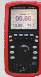
SBS-6500 Battery Analyzer

For more information on the hydrometer, see the SBS-2003 data sheet.