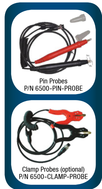
Pin Probes P/N 6500-PIN-PROBE