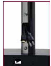
Internal cable management