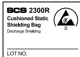
Label placed on Cushioned bag

Tolerances: Width: +/- 1/4" Length: +/- 1/4" Lip: 2" +/- 1/2" Seal width: 3/8" +/- 1/8"