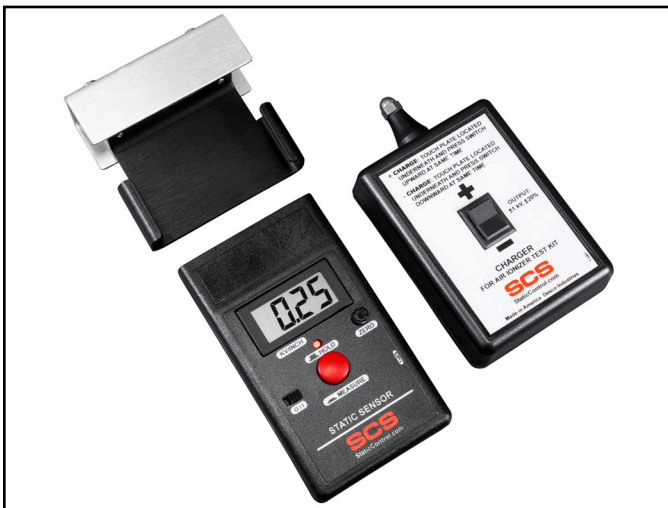
Figure 2. SCS 770717 Air Ionizer Test Kit