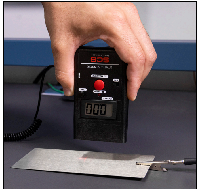
Figure 6. Pointing the Static Sensor to a grounded surface

Slide the power switch to the right to power the Static Sensor. Point the top of the Static Sensor approximately 1 inch (2.5 cm) away from a grounded metal surface. Proper spacing is indicated when the two red bullseyes emitted LED range indicator become centered on top of each other. Turn the rotary zero knob until the Static Sensor's display reads 0.00.