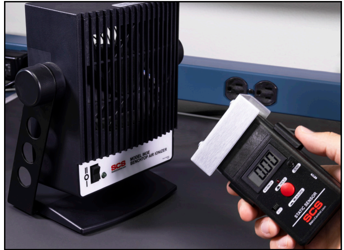
Figure 9. Using the Static Sensor with Conductive Plate to measure the offset voltage of a benchtop ionizer

NOTE: When testing pulsed ionizer systems, the voltage displayed is constantly changing. This pulse rate may be faster than the display update rate of the Static Sensor, therefore the displayed voltage is an average of the actual voltage. The output of the Static Sensor is useful in this situation for more accurate measurements.