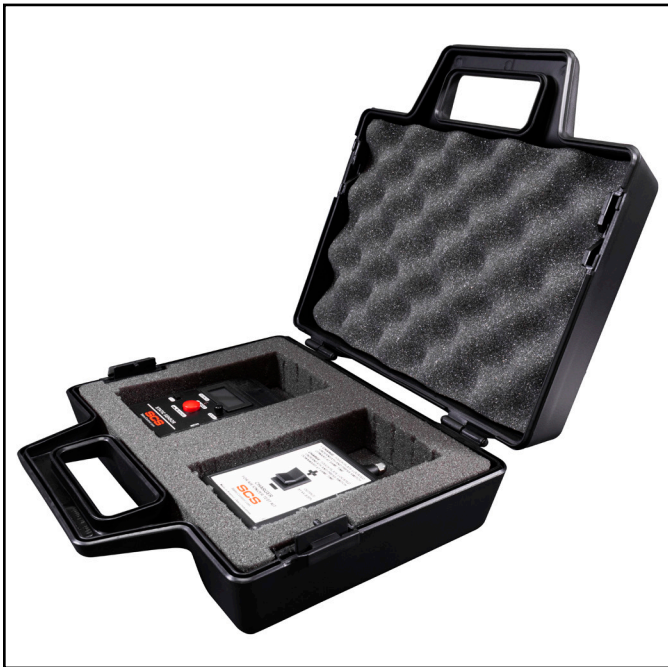
Figure 3. Air Ionizer Test Kit and Carrying Case