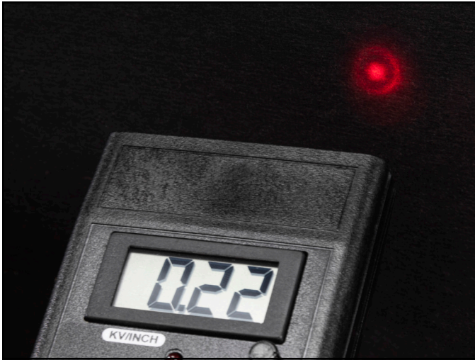
Figure 7. Aligning the two bullseyes emitted by the LED range indicator