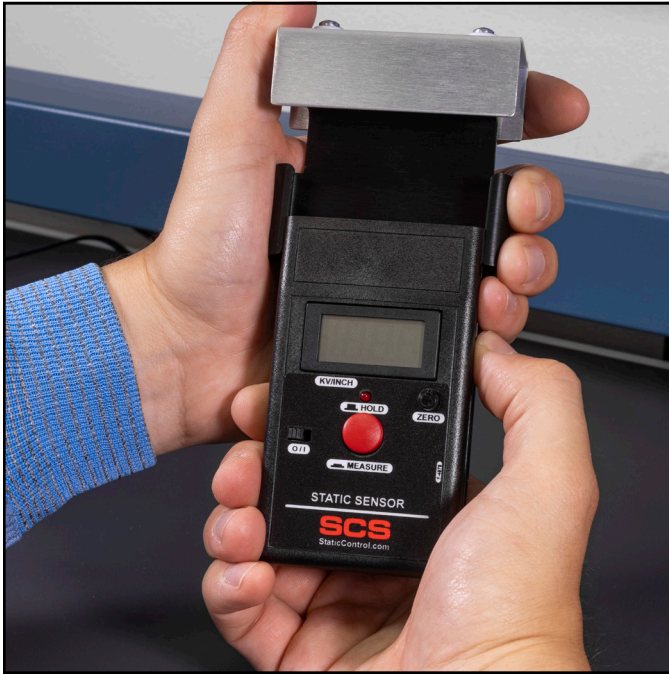
Figure 8. Sliding the Conductive Plate onto the Static Sensor