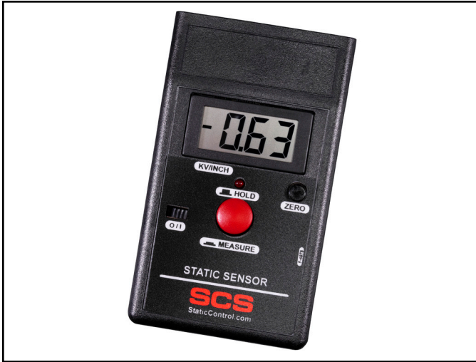
Figure 1. SCS 770716 Static Sensor