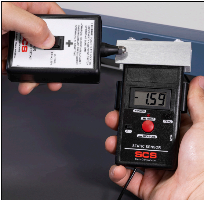
Figure 10. Using the Charger to apply a charge onto the Conductive Plate

NOTE: A ground path must be provided between the touch plate of the Charger and the ground reference of the Static Sensor. This is normally provided by holding the Charger in one hand and the Static Sensor with Conductive Plate in the other.