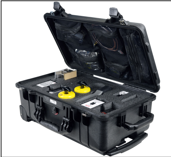
Figure 1. SCS 770045 EOS/ESD Assessment Kit