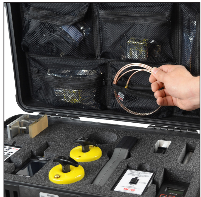
Figure 2. Using the EOS/ESD Assessment Kit's lid organizer

The ESD Program Standard ANSI/ESD S20.20 can be downloaded here: https://www.esda.org/standards/esda-documents/