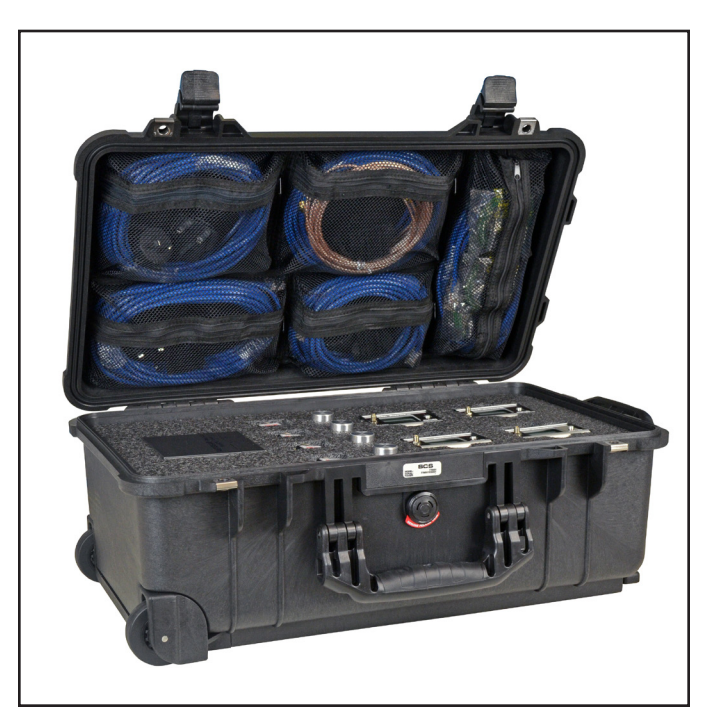
Figure 1. SCS 770051 ESD Event Diagnostic Kit

Per ANSI/ESD S20.20 section 6.1.3.1 Compliance Verification Plan Requirement "A Compliance Verification Plan shall be established to ensure the organization's compliance with the requirements of the Plan. Formal audits or certifications shall be conducted in accordance with a Compliance Verification Plan that identifies the requirements to be verified, and the frequency at which those verifications must occur. Test equipment shall be selected to make measurements of appropriate properties of the technical requirements that are incorporated into the ESD program plan."