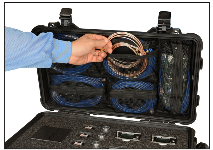
Figure 2. Using the the lid organizer to store accessories

SMP continuously monitors an ESD process control system throughout all stages of manufacturing. SMP captures data from SCS workstation, equipment and ESD event continuous monitors and provides a real-time picture of critical manufacturing processes. All activity is stored into a database for on-going quality control purposes. SMP allows its administrators to pinpoint areas of concern and prevent ESD events. Quantifiable data allows its administrators to see trends, become more proactive and prove the efficiency of their ESD process control system.