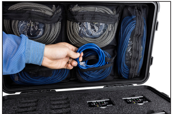
Figure 2. Using the the lid organizer to store accessories

Per ANSI/ESD S20.20 section 6.1.3.1 Compliance Verification Plan Requirement “A Compliance Verification Plan shall be established to ensure the organization’s compliance with the requirements of the Plan. Formal audits or certifications shall be conducted in accordance with a Compliance Verification Plan that identifies the requirements to be verified, and the frequency at which those verifications must occur. Test equipment shall be selected to make measurements of appropriate properties of the technical requirements that are incorporated into the ESD program plan.”