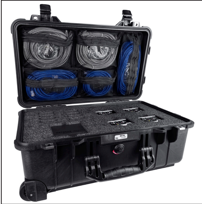
Figure 1. SCS 770052 Workstation Diagnostic Kit