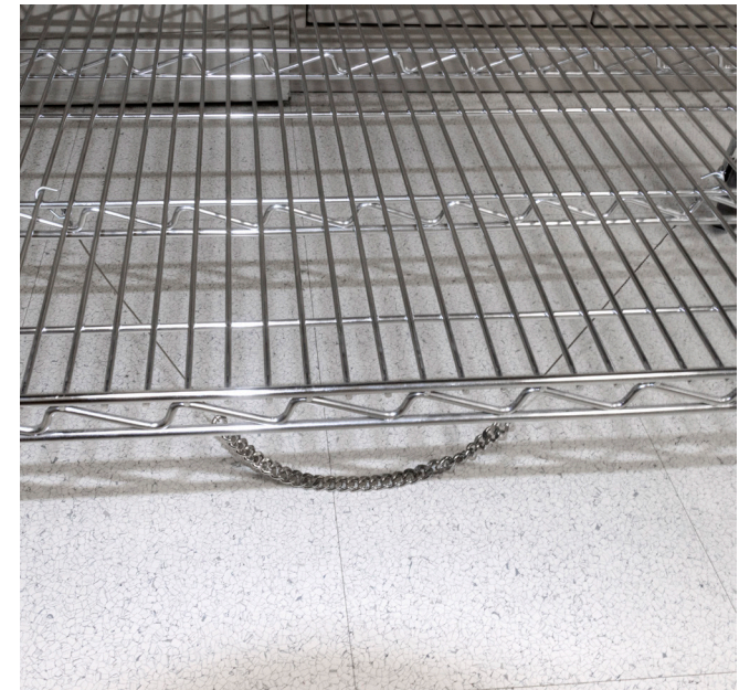
Cart shown for illustration only.