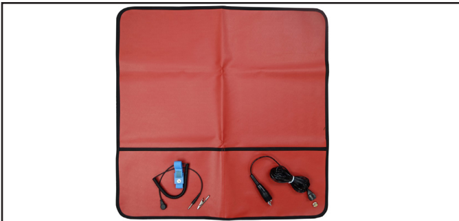
Figure 4. FSKL3RD Field Service Kit.