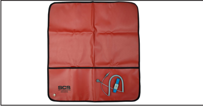
Figure 3. 8507 Field Service Kit.