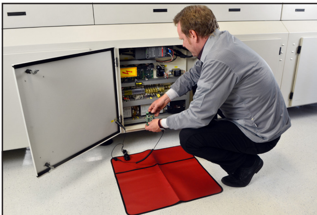
Figure 1. Proper field service ESD control.

“When neither AC equipment [Equipment Grounding Conductor] or auxiliary grounds are available, an equipotential bonding system may need to be used. In this situation, all of the items in the system are bonded together so that the charge that resides on the elements will be shared equally and therefore there will be no potential difference between the items. Once this step has been completed it is safe to handle ESD sensitive parts without inducing damage. A real life example of this is often observed in office equipment field service operations. For safety reasons the service technician will often disconnect the AC power cord which detaches the equipment from ground. In order to safely install ESD sensitive products into the equipment, it is necessary to electrically connect or bond together the service technician, the equipment frame and the ESD sensitive product. Once bonded together an ESD event will NOT occur when the technician handles the product or installs it in the office equipment.” [ESD Handbook ESD TR20.20 section 5.1.3 Basic Grounding Requirements]