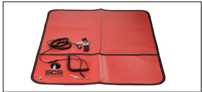
Figure 2. 8501 Field Service Kit.