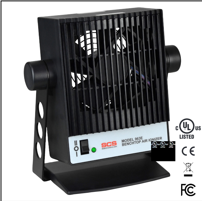
Figure 1. SCS 963E Benchtop Air Ionizer