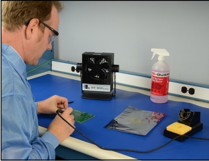
Figure 2. Using the 963E Benchtop Air Ionizer