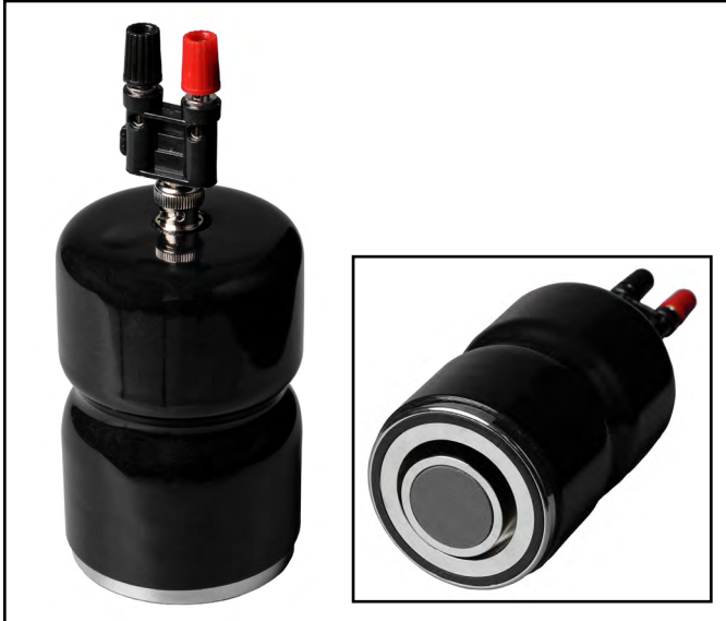
Figure 1. SCS 770007 Concentric Ring Probe