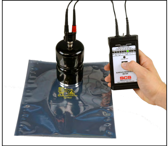
Figure 4. Using the Concentric Ring Probe with the SCS SRMETER2 Surface Resistance Meter