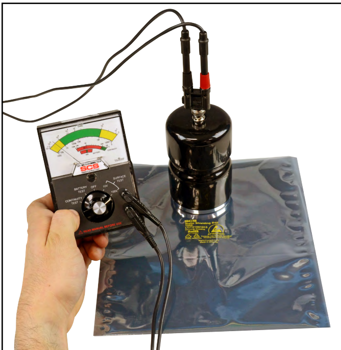
Figure 3. Using the Concentric Ring Probe with the SCS 701 Analog Surface Resistance Megohmmeter