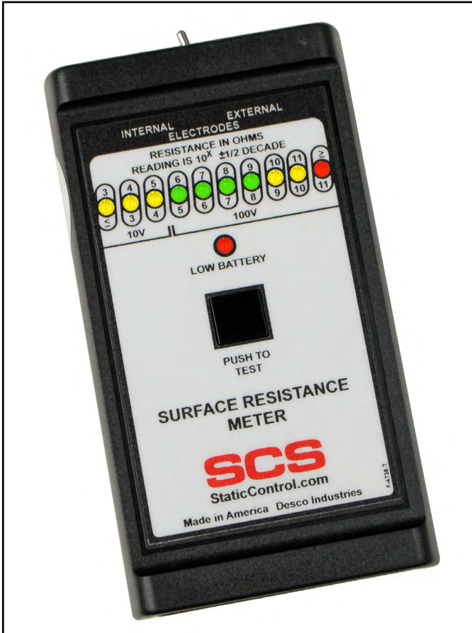
Figure 1. SCS SRMETER2 Surface Resistance Meter