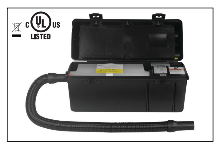
Figure 1. 497AJH HEPA Vacuum.