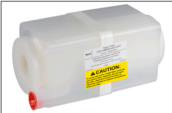
Figure 4. SCS SV-MPF2 Type 2 Replacement Filter