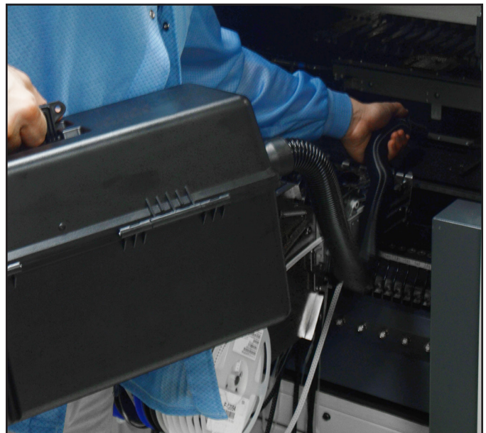
Figure 3. Using the 497 Electronic Service Vacuum

Use the power switch to power the vacuum ON. Use the carrying handle or SV-CS1 carrying strap to carry and transport the vacuum.