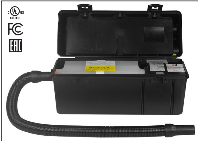
Figure 1. SCS 497 Electronic Service Vacuum