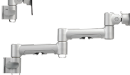
SA46S 460mm arm