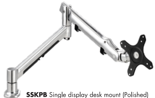
SSKPB Single display desk mount (Polished)