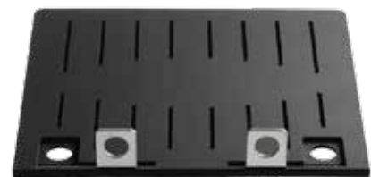
SNBT Notebook tray