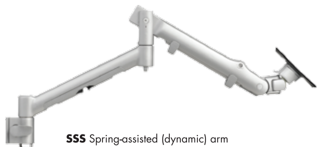
SSS Spring-assisted (dynamic) arm