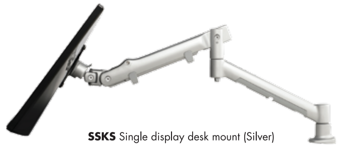
SSKS Single display desk mount (Silver)

THE SSK IS THE FLAGSHIP PRODUCT OF THE SYSTEMA RANGE, CARRYING UP TO 8KG & 29" MONITORS. THIS SPRING ASSISTED AND DYNAMIC MONITOR ARM IS THE MOST FUNCTIONAL ARM ON THE MARKET.