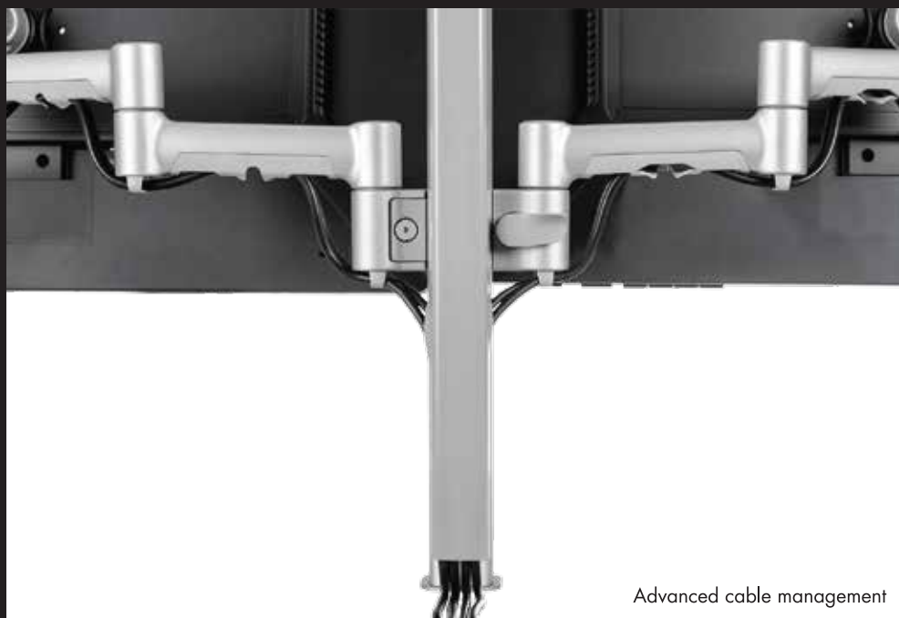
Advanced cable management