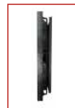
Profile with display attached

* Please check compatibility formula with your display dimensions.