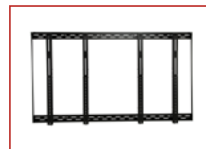
2x2 Mounting Kit

UNIVERSAL ADAPTOR RAILS Horizontal adjustment makes mounting and aligning displays quick and easy