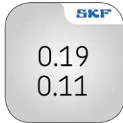
Values app Use measuring heads like digital dial gauges