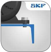
Soft Foot app Identification and correction of soft foot