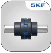
Shaft Alignment app Alignment of machines with horizontal shafts