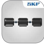
Machine Train app Alignment of machine trains