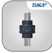
Vertical Shaft app Alignment of machines with vertical shafts