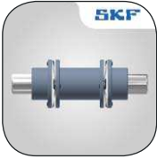
Spacer Shaft app Alignment of machines with spacer shafts