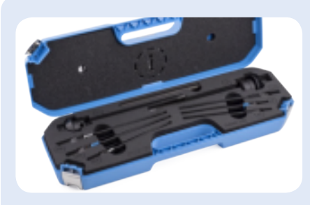
Bearing selection chart included