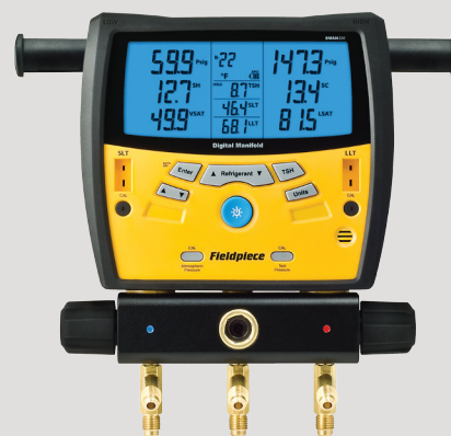
SMAN320 Includes: 3-Port Digital Manifold