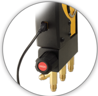
Mini USB Port to Quickly Update Refrigerants