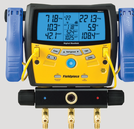
SMAN340 Includes: 3-Port Digital Manifold Pipe Clamps Padded Case