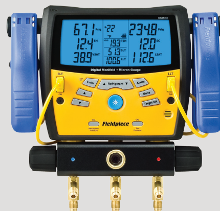
SMAN360 Includes: 3-Port Digital Manifold Built in Micron Gauge Pipe Clamps Padded Case