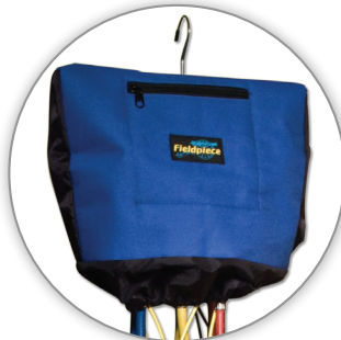
Padded Case to Easily Hang Manifold with Hoses Attached