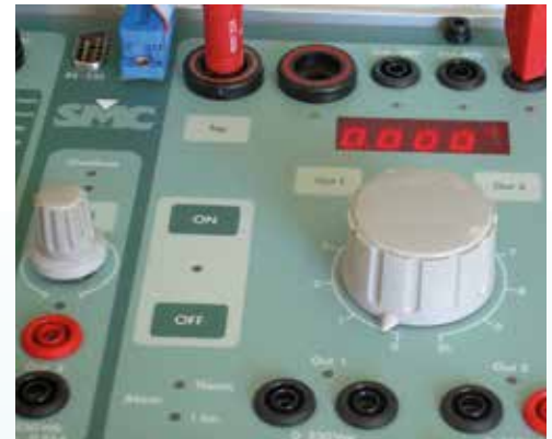
Ergonomically designed control panel for accurate and fast testing

Adjustable voltage: 0-140 V, 40-70 Hz, 0-359.9°