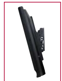
Adjustable +15/-5° tilt

205 Westwood Ave, Long Branch, NJ 07740 Phone: 866-94 BOARDS (26273) / (732)-222-1511 Fax: (732)-222-7088 | E-mail: sales@touchboards.com