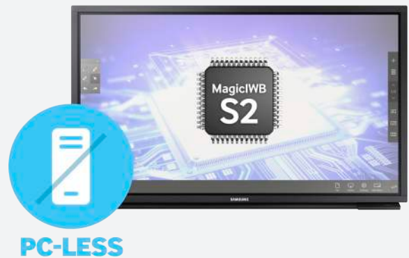
Figure 3. Embedded e-Board Solution that doesn't require a dedicated PC