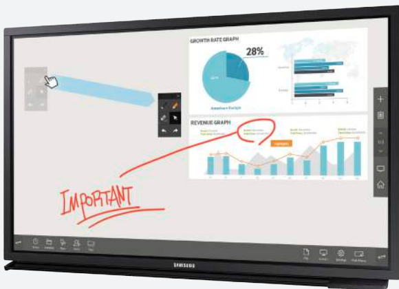
Figure 4. Feature for Easy Floating Menu and Draw on any Source