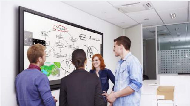
Figure 1. Increase productivity with interactive meetings