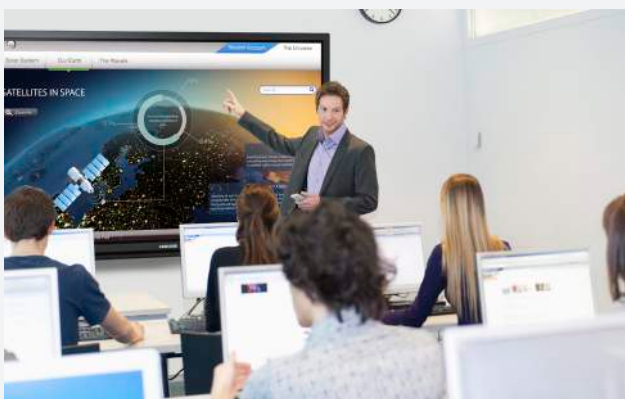
Figure 2. New lines of communication in the classroom

Gone are the days of educators needing to factor in the logistics of a typical projector system and the pitfalls and distractions that they come with. Samsung Interactive Whiteboard Solution converts these past shortcomings into strengths through effective utilization of FHD displays and interactive whiteboards. New lines of communication between teachers and students can now be forged, through data and file-sharing capabilities between the Interactive Whiteboard Solution and devices of students, thus further creating an interactive presentation environment that holds attention spans and creates opportunity to diversify learning approaches. Samsung Interactive Whiteboard Solution is well suited to help you convert your classroom into an intensive and engaging learning environment.