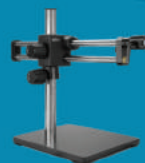
SB-BM2-D0 * DUAL BOOM STAND