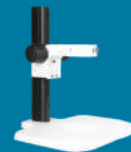
ST-76-LG ERGO TRACK STAND