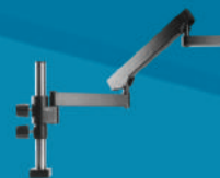
SB-CL2-FX * HEAVY DUTY ARTICULATING STAND