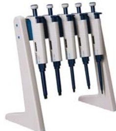
Linear Pipettor Stand