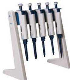
Linear Pipettor Stand

Ejector collar and tip cone..... can be removed