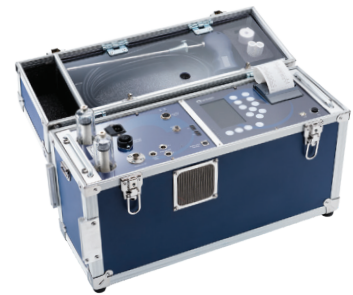
TABLE A (Gas Sensor Options – Choose up to 8)

S9000-OCNL-IR-12H = O2, Standard CO, Low Range NO, IR Bench (CO2, CxHy & High CO), with 12" Heated Line & Probe