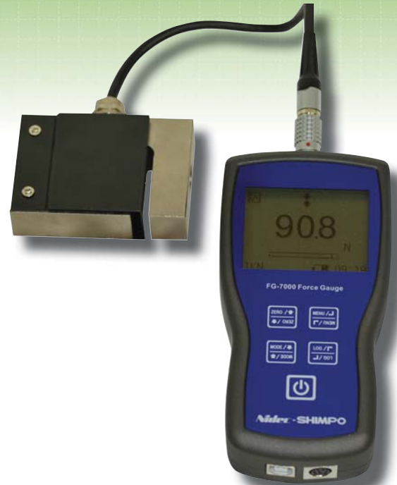
FG-7000L with Connected Load Cell

The FG-7000L's robust housings are designed to fit perfectly in the operator's hand for portable testing. The large back-lit, 180° auto-reversible display, compression/tension icons, combined with the dual labeled key pad allows for usage of the gauge in various positions while still being able to easily view and operate. These many features make the FG-7000L the ideal force instrument for various applications such as, incoming quality inspection, finished goods testing, R&D or almost any force testing requirement.