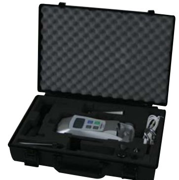
FGV-HXY with Accessories in Protective Carrying Case