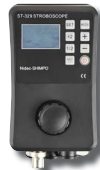
ST-329 Operation Control Enclosure