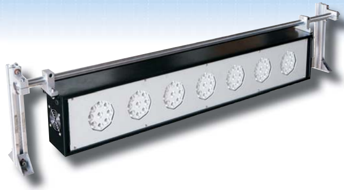
ST-329BL-4 LED Array shown with Optional Mounting Kit

The ST-329BL is designed for speed and frequency measurements in the printing, packaging, textile, automotive, cable, medical industries in various applications.