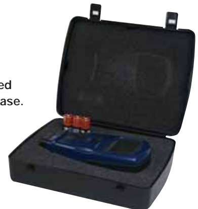
PT-110 with included protective carrying case.