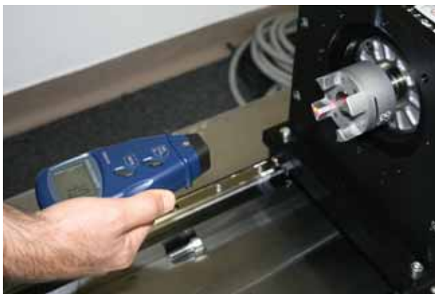
PT-110 recording rotational speed of machinery.