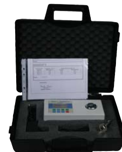
TT with Included Accessories and Carry Case