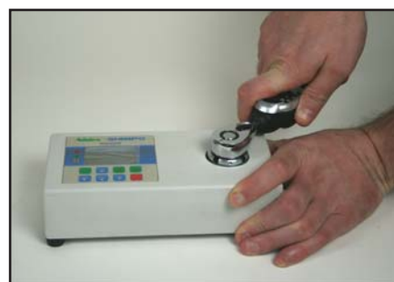
TT Shown Testing Torque Wrench