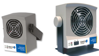
Model 6422e-AC (left) blower is ideal for in-tool confined spaces. Model 6432e (right) blower may be used inside tools or at a workstation.

The slightly larger Model 6432e has a tool mounting bracket or benchtop stand.