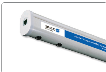
Model 5685 Ionizing AeroBar