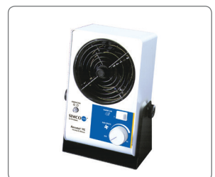
Aerostat PC Ionizing Air Blower