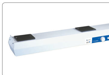
Aerostat Guardian Overhead Ionizer