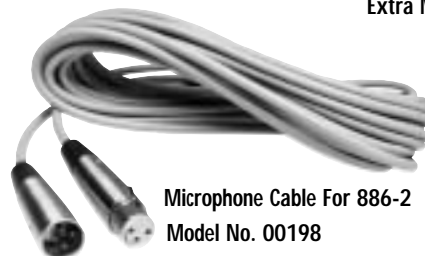
Microphone Cable For 886-2 Model No. 00198