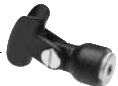
Tripod Mount Microphone Holder Model No. 00184