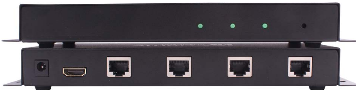
HDX-400-Pro Front and Rear