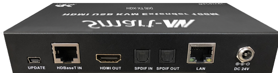
HDX-XT (TX) REAR