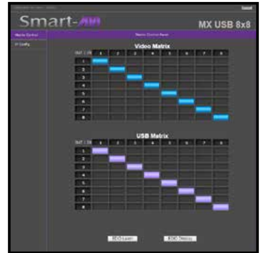
Connect to the MXU-88's web console for complete device management over the Internet.

Web Console: control switching, display settings, peripherals, and more from the MXU-88 web-based control interface.