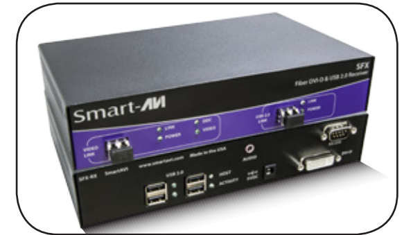
DVI-D, USB 2.0, Audio and RS232 Fiber Extender