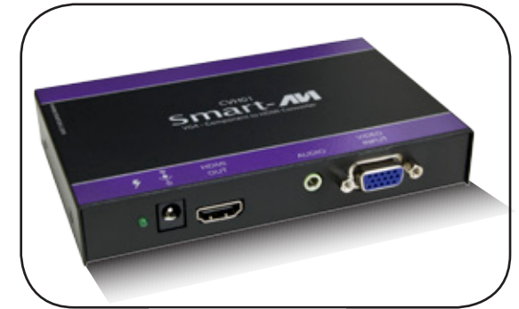
VGA and Audio to HDMI Converter