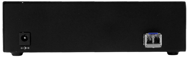
FVX-3000-PRO Receiver Back Panel