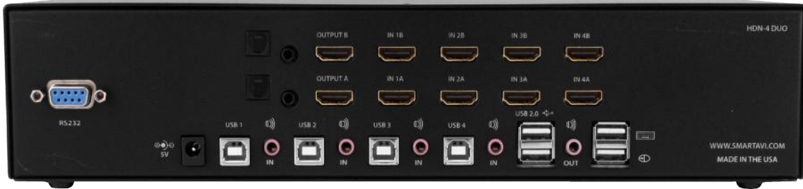
HDN-4 DUO Rear