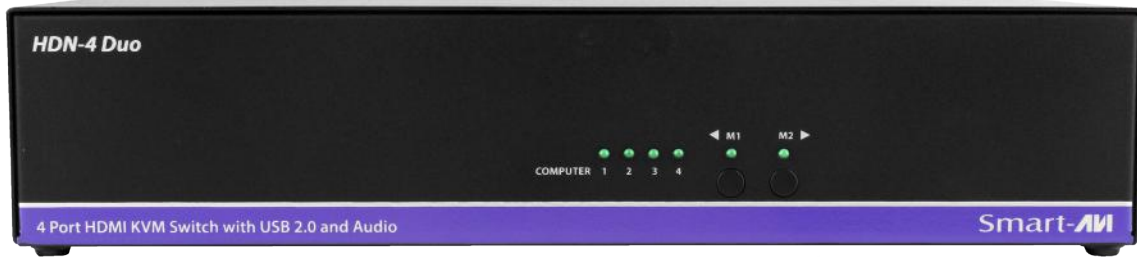
HDN-4 DUO Front